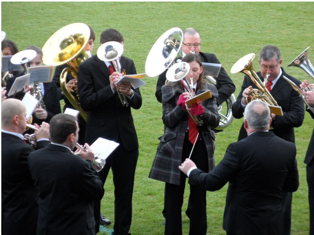
Bollington Brass Band performing on the pitch before the Wigan FA Cup match

SIS television had left their gantries in position after the Cardiff match and again screened the match live around the world with ITV including the match in their Highlights Show on the same evening. Again BBC Radio 5 Live and BBC Radio Manchester both broadcast commentaries from the ground. The McIlroy Lounge was full to capacity with diners who were greeted with a glass of champagne or orange juice, followed by a three-course meal. Each diner received a new Macclesfield Town scarf and a champagne glass inscribed with the details of the match in a presentation box. Again the Bollington Brass Band performed before the match.