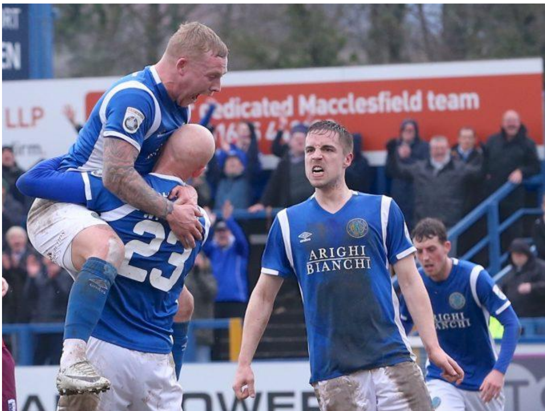
Goal celebrations against Barrow - 10 March (PH)