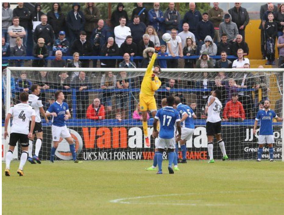
Goalmouth Action against Derby County