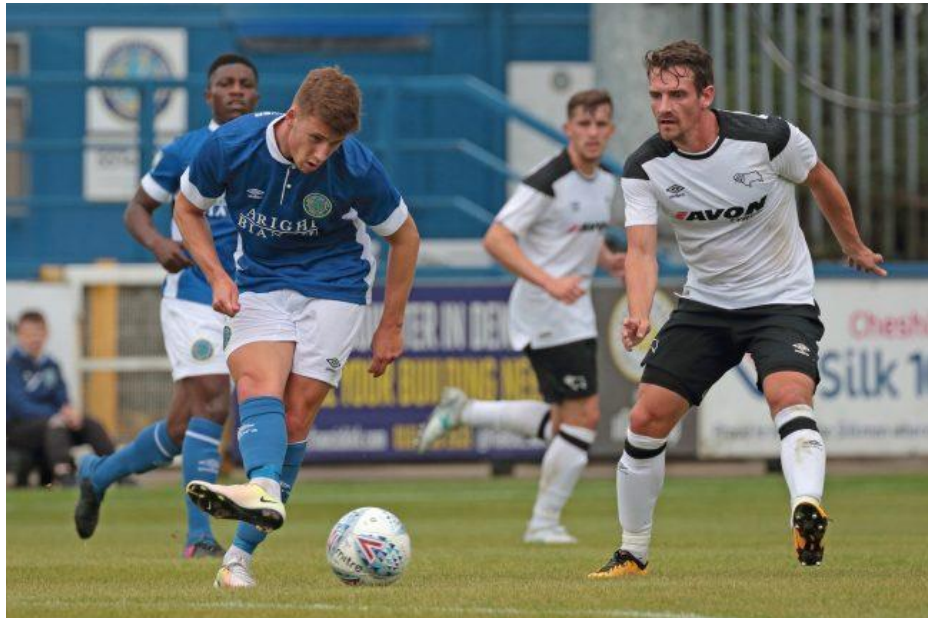
Action against Derby County

During pre-season training Shay Given, Wes Brown and Alex Bruce were present. Wes Brown and Alex Bruce were both studying for their coaching badges and took a training session whilst Shay Given took part in training sessions with the goalkeepers.