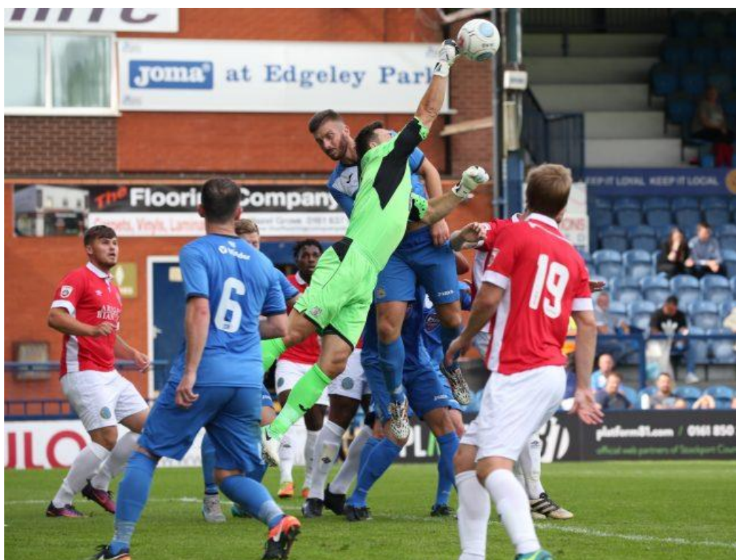
Match action at Stockport County