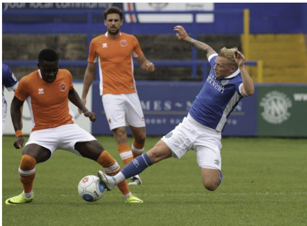
Action from the friendly against Blackpool