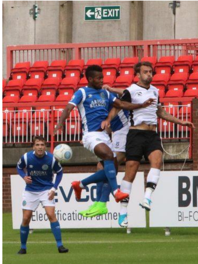
Match action in the 3-0 defeat at Gateshead – 19 August (CW)