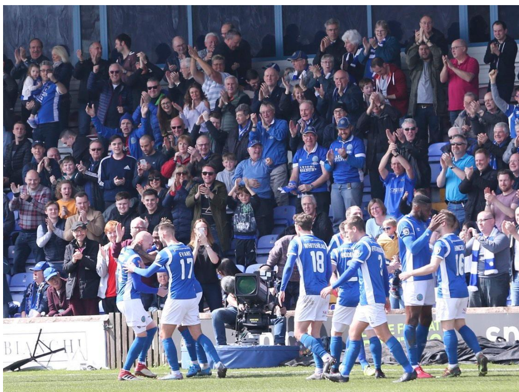
A packed stand at the match against Leyton Orient - 14 April (PH)