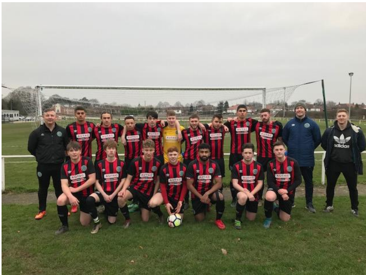
Macclesfield Town under 21 Development Team (SLE)