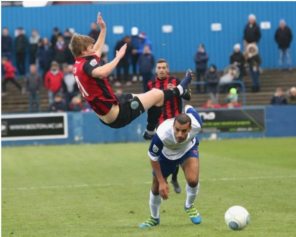
Acrobatic play in the 2-0 win at Barrow - 11 November (PH)