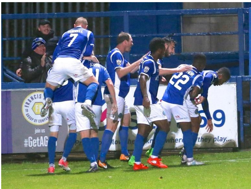
Goal celebration against AFC Fylde at the Moss Rose - 12 September (PH)