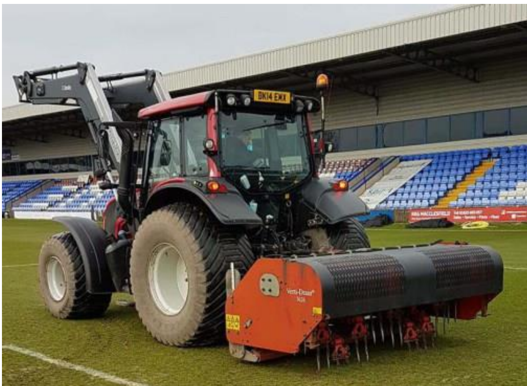
Verti-drain machinery in action (SST)