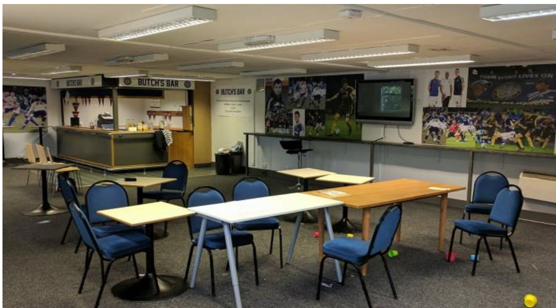
Butch's Bar (SLE)