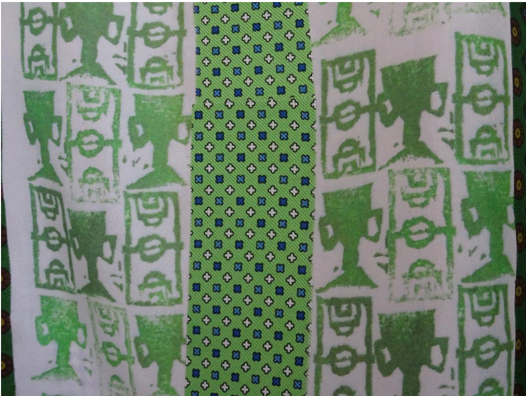
Home Base Exhibition - shirt detail (author)