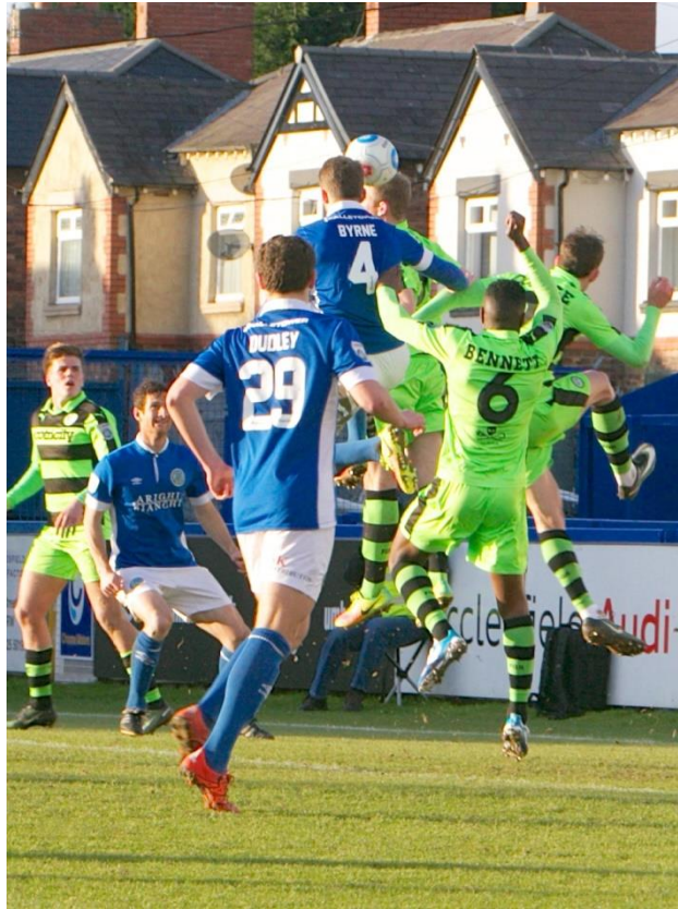
Match Action from the third round of the FA Trophy at the Moss Rose against Forest Green Rovers