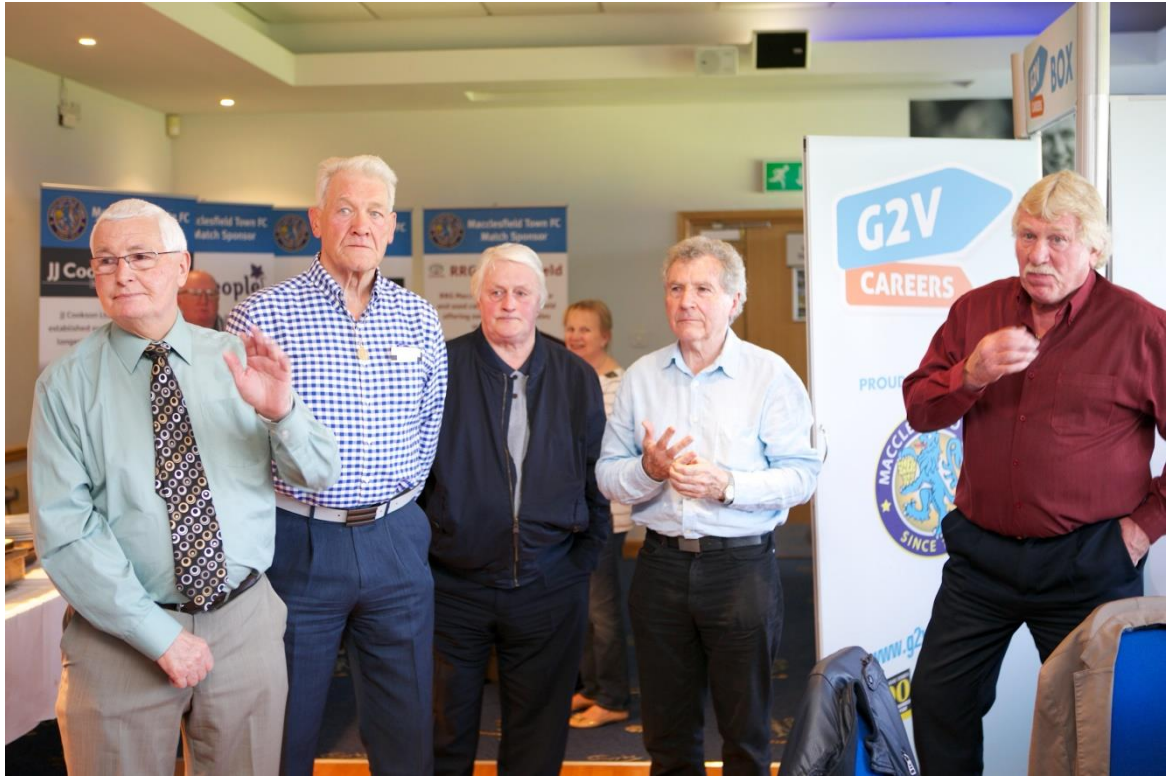
Members of the 1970 FA Trophy winning team who were guests of the club at the Dagenham & Redbridge match on 8 April