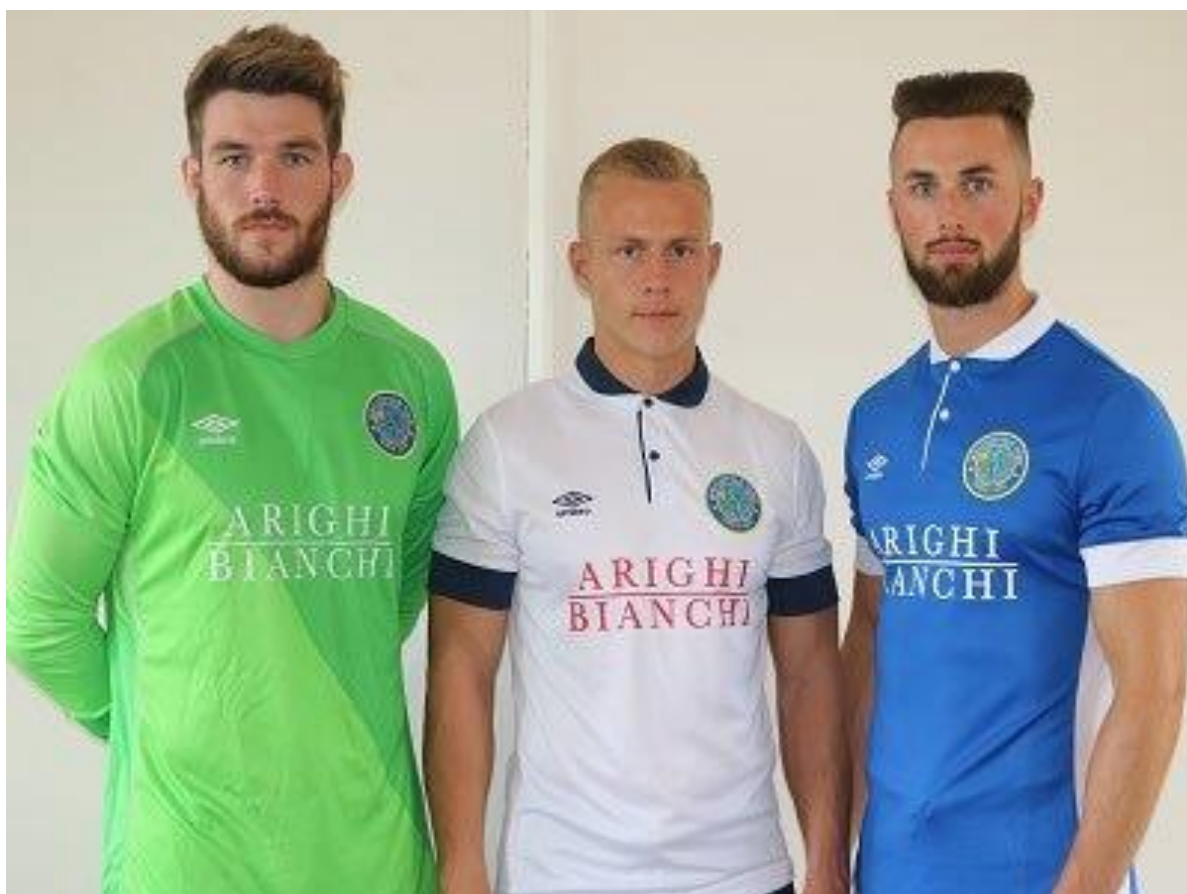
Team Kit for 2017-18 Season with Arighi Bianchi Sponsorship