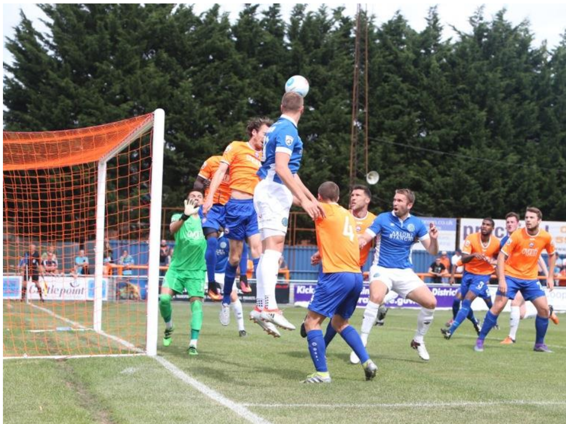
Match action at Braintree Town on 13 August