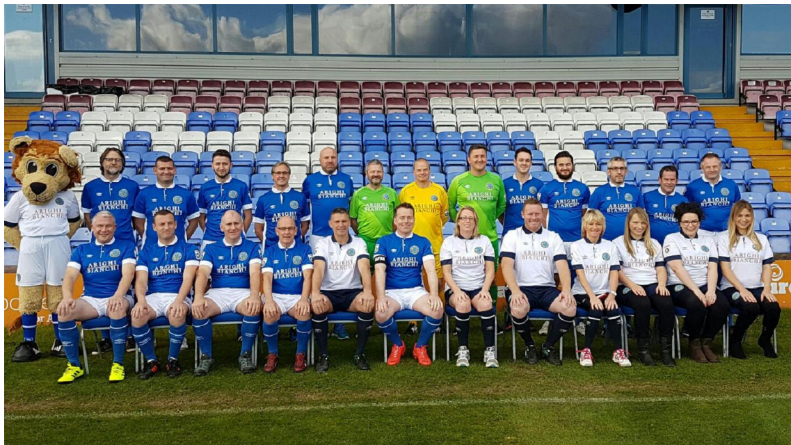
Club Sponsors in Team Kit

Supporters of each football club were involved in designing items to reflect their own club's heritage with the project culminating in an exhibition, 'Souvenirs from Home', of their work in their own town. The 'souvenirs' for Macclesfield Town were exhibited in the Museum section of the Old Sunday School in January 2017 and included football shirts and buttons. At the end of this section are photographs which give a flavour of the exhibition.