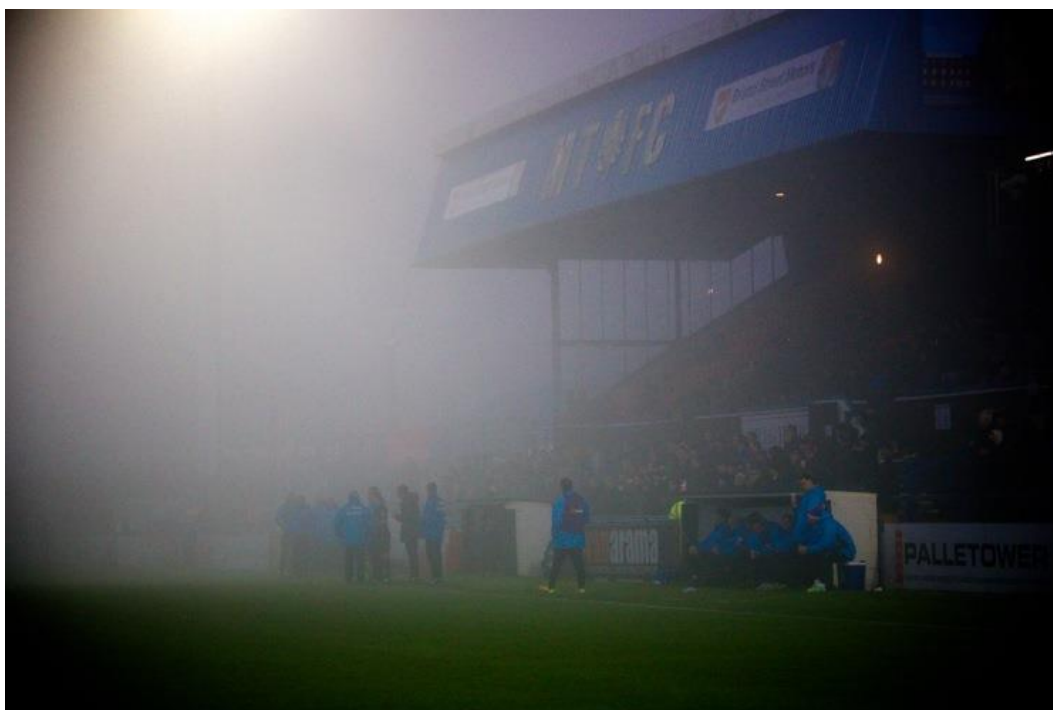
Foggy conditions at the match against Dover on 26 November which was eventually abandoned by the referee