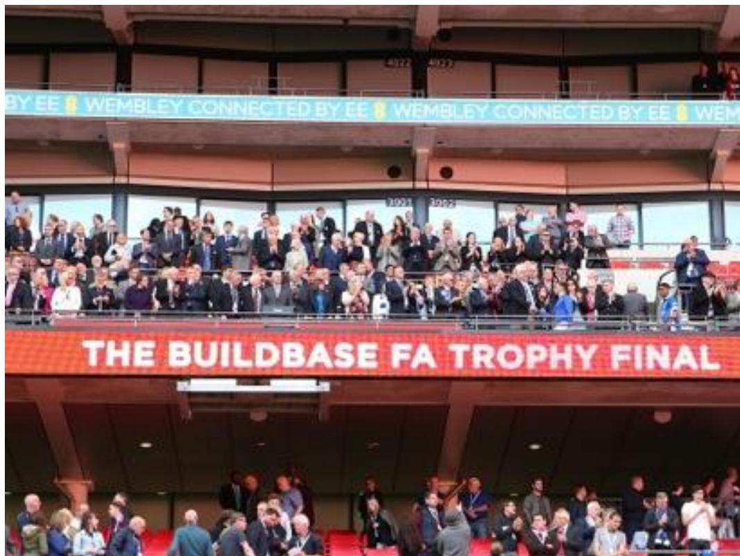
Macclesfield collect their runners-up medals