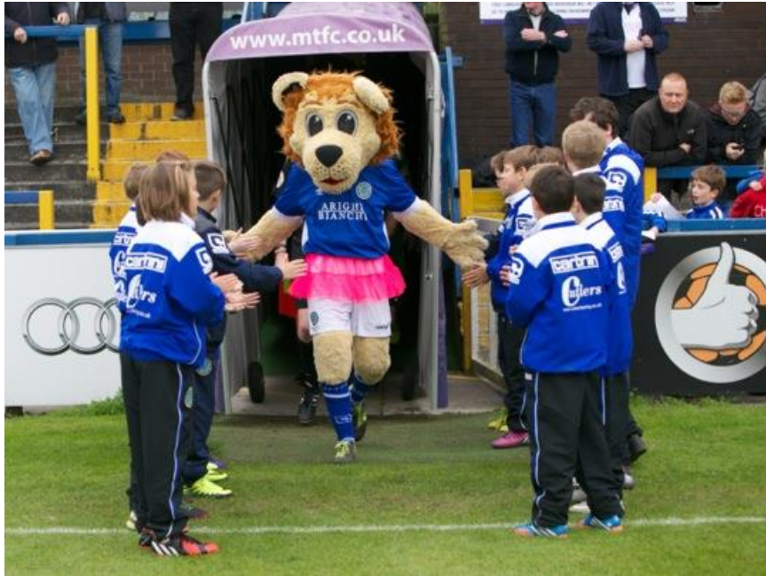
Club Match Mascot wearing 'something pink' as part of the 'Paint Macc Pink' campaign for the Prevent Breast Cancer campaign