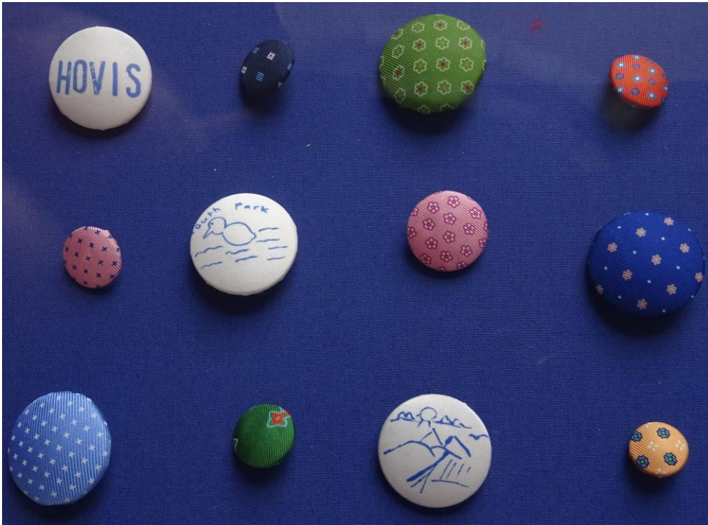
Home Base Exhibition – Buttons (author)