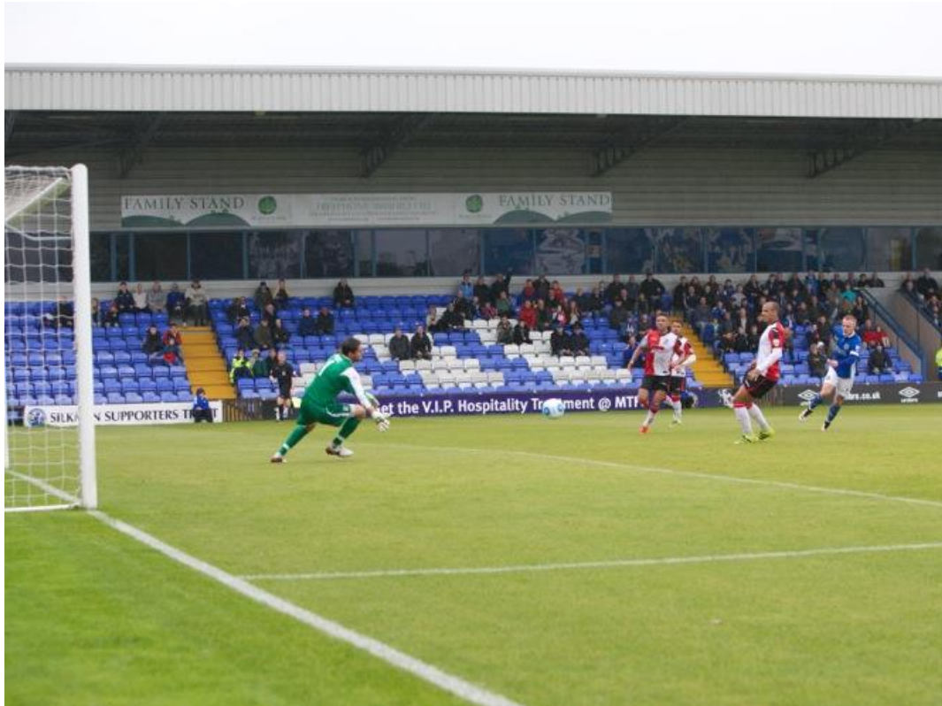
Danny Rowe's goal against Woking on 3 September