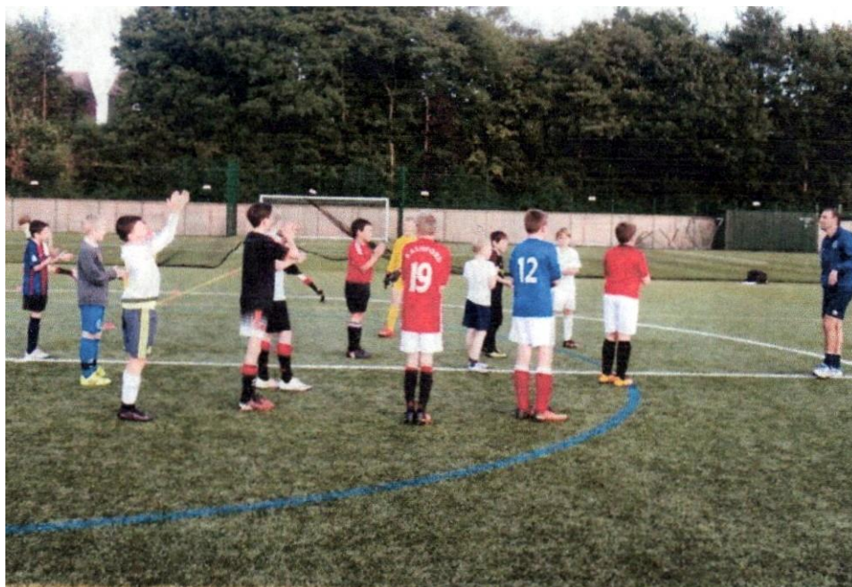
Project 21 (MTFC)