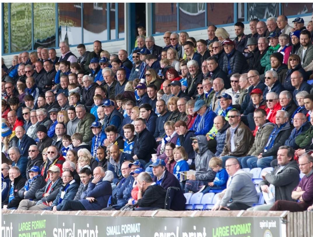
A packed Moss Lane stand at the final match of the season against Sutton United, supporters taking advantage of the free admission.