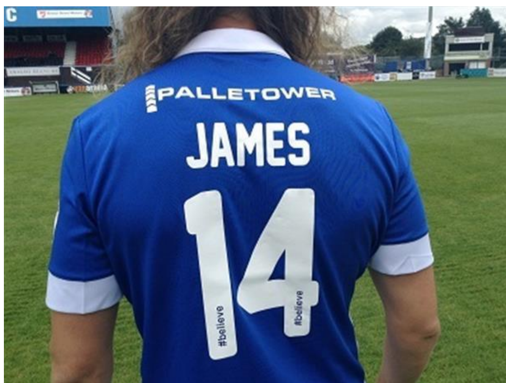
Palletower Shirt Sponsorship