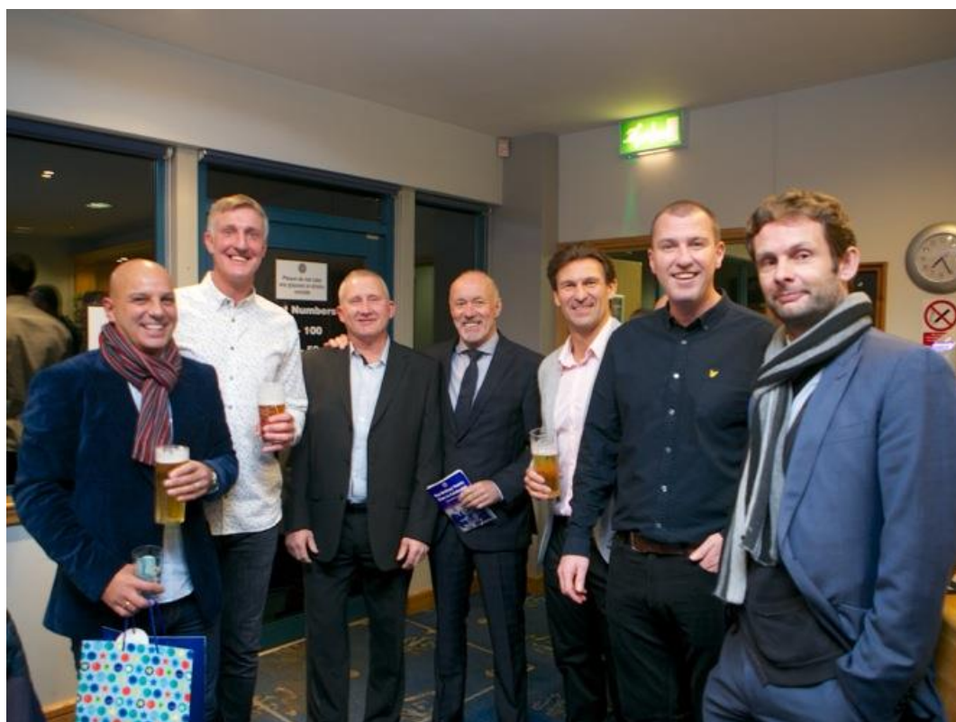
Former players with Sammy McIlroy celebrating the Sammy McIlroy Years