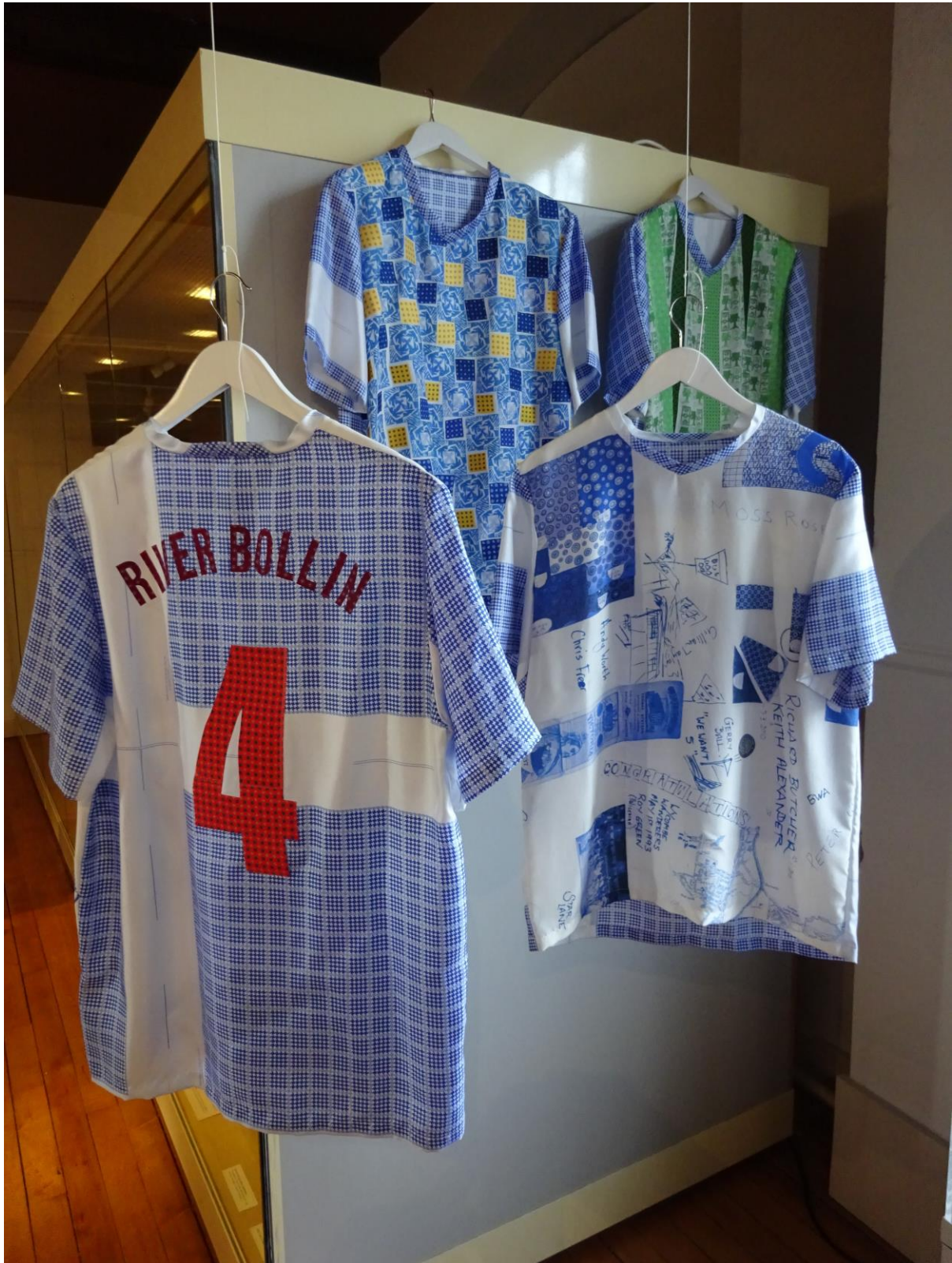
Home Base Exhibition - General Display (author)