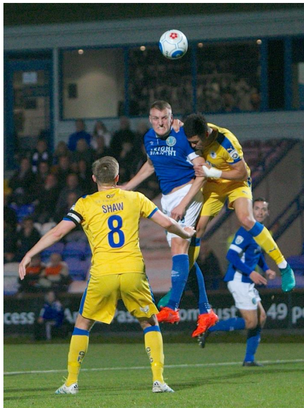
Match action in the 0-0 draw against Chester at the Moss Rose on 25 October