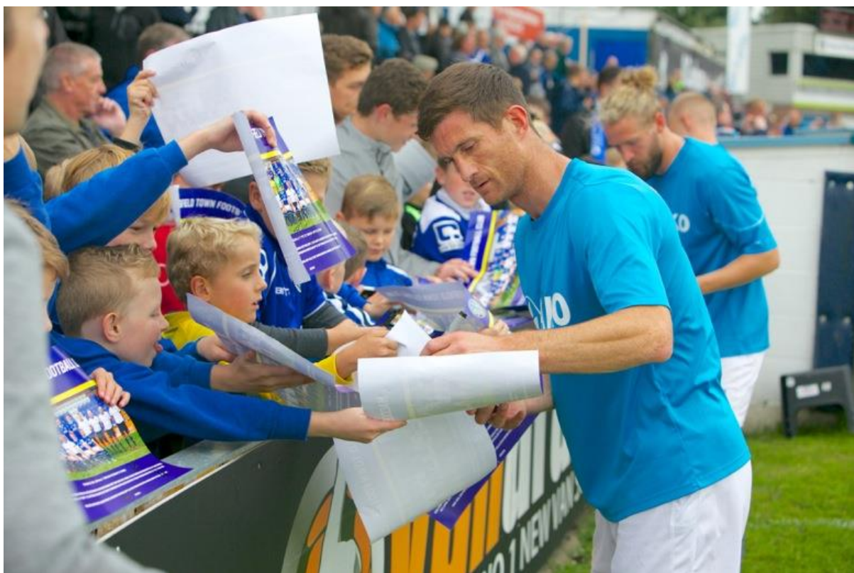
Young fans obtaining autographs from the new standing Family Area