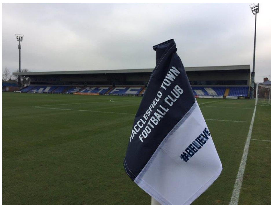
The redesigned Corner Flag

For the third consecutive month, Macclesfield held 10 th position (although they had reached seventh during the month) with a total of 37 points.