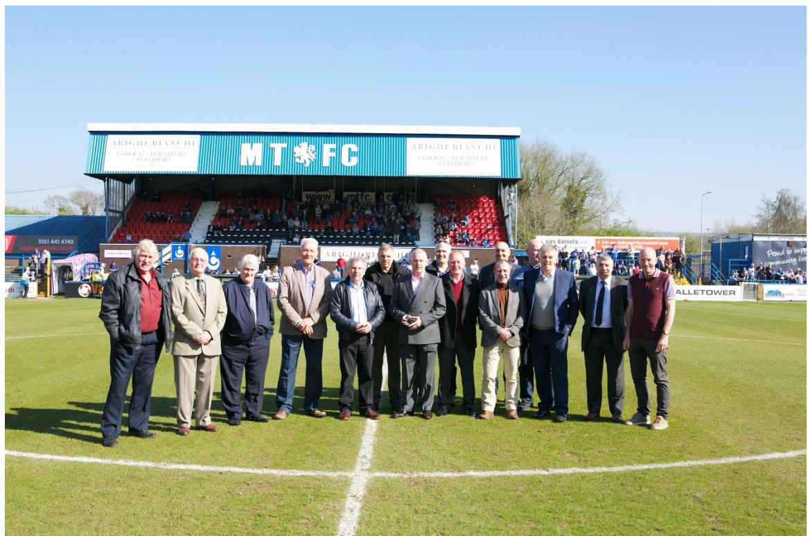
The 1970 FA Trophy winning team members with members of the NPL Treble winning team on the pitch at half time at the match against Dagenham & Redbridge