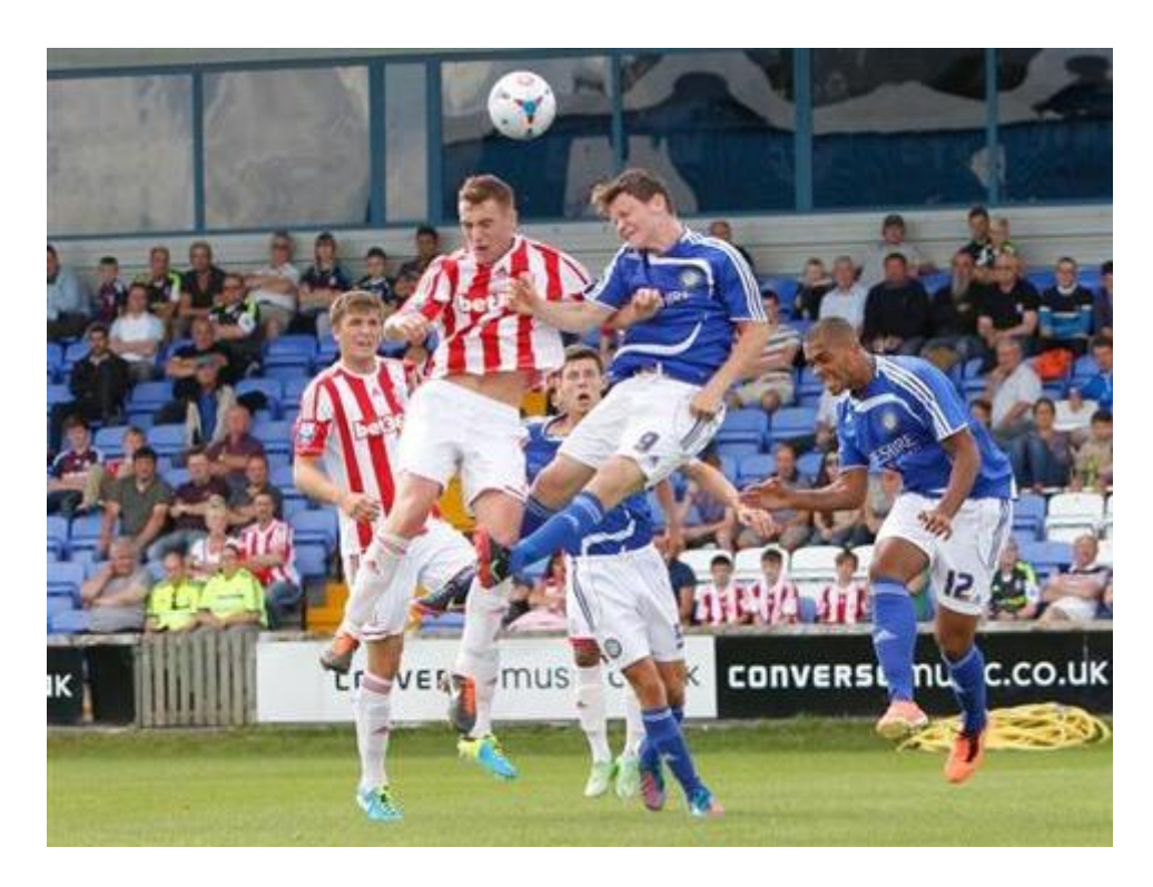
Match Action - Stoke City