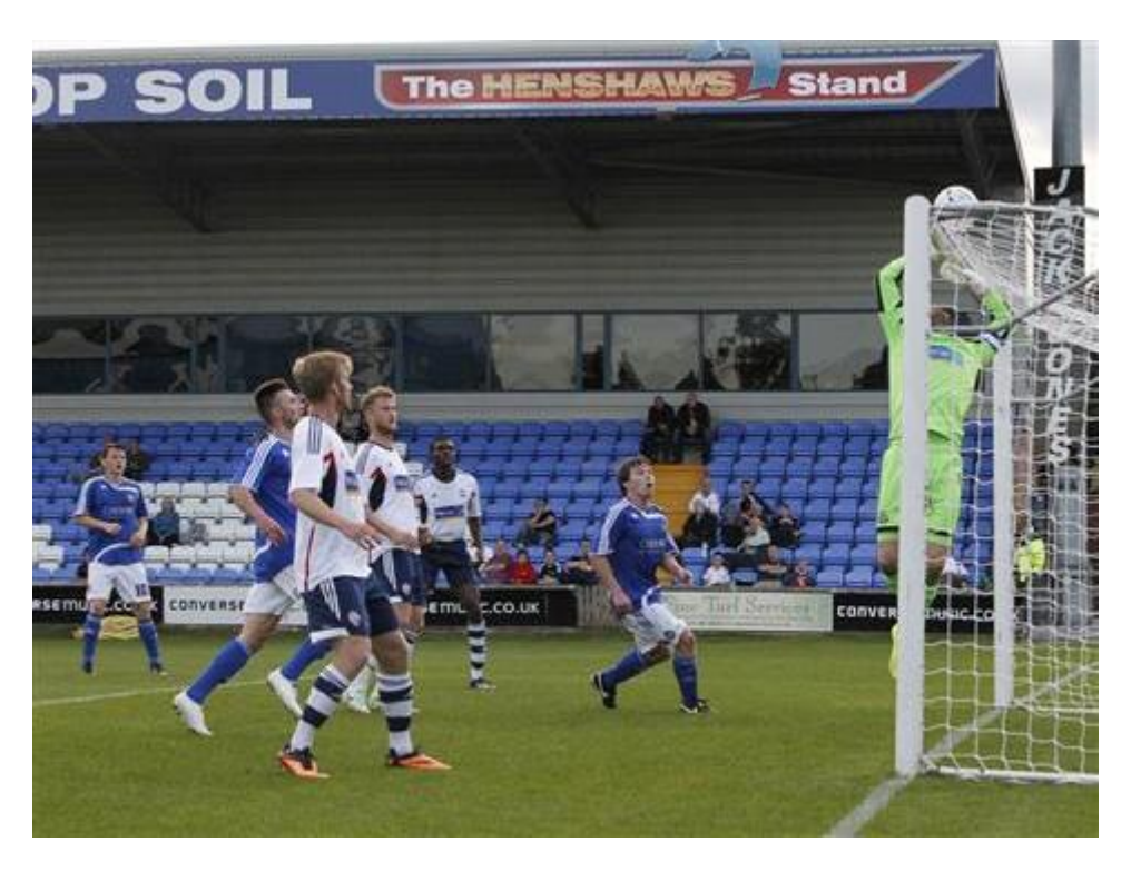
Match action - Bolton Wanderers