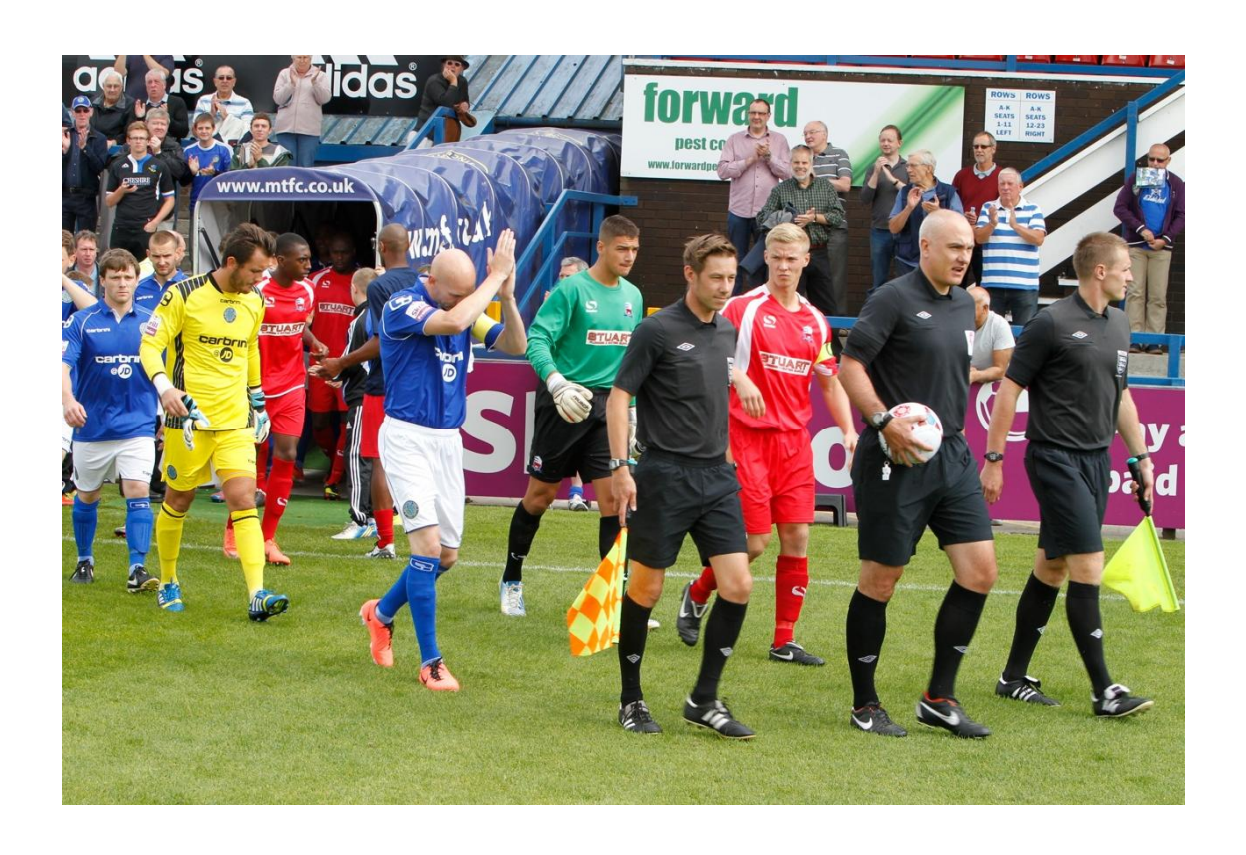
Opening match against Nuneaton Town