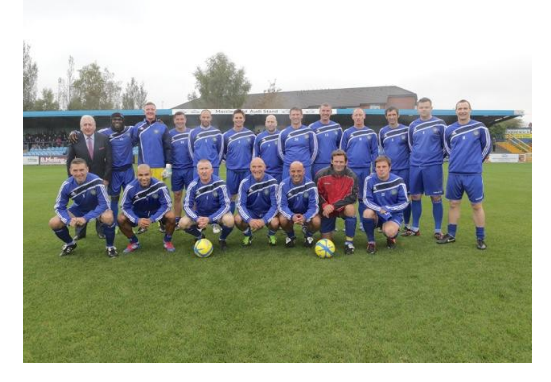
All Stars Match - Silkmen Legends Team