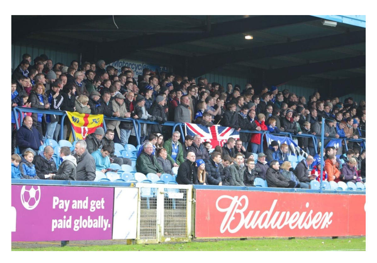
Sheffield Wednesday - Star Lane End